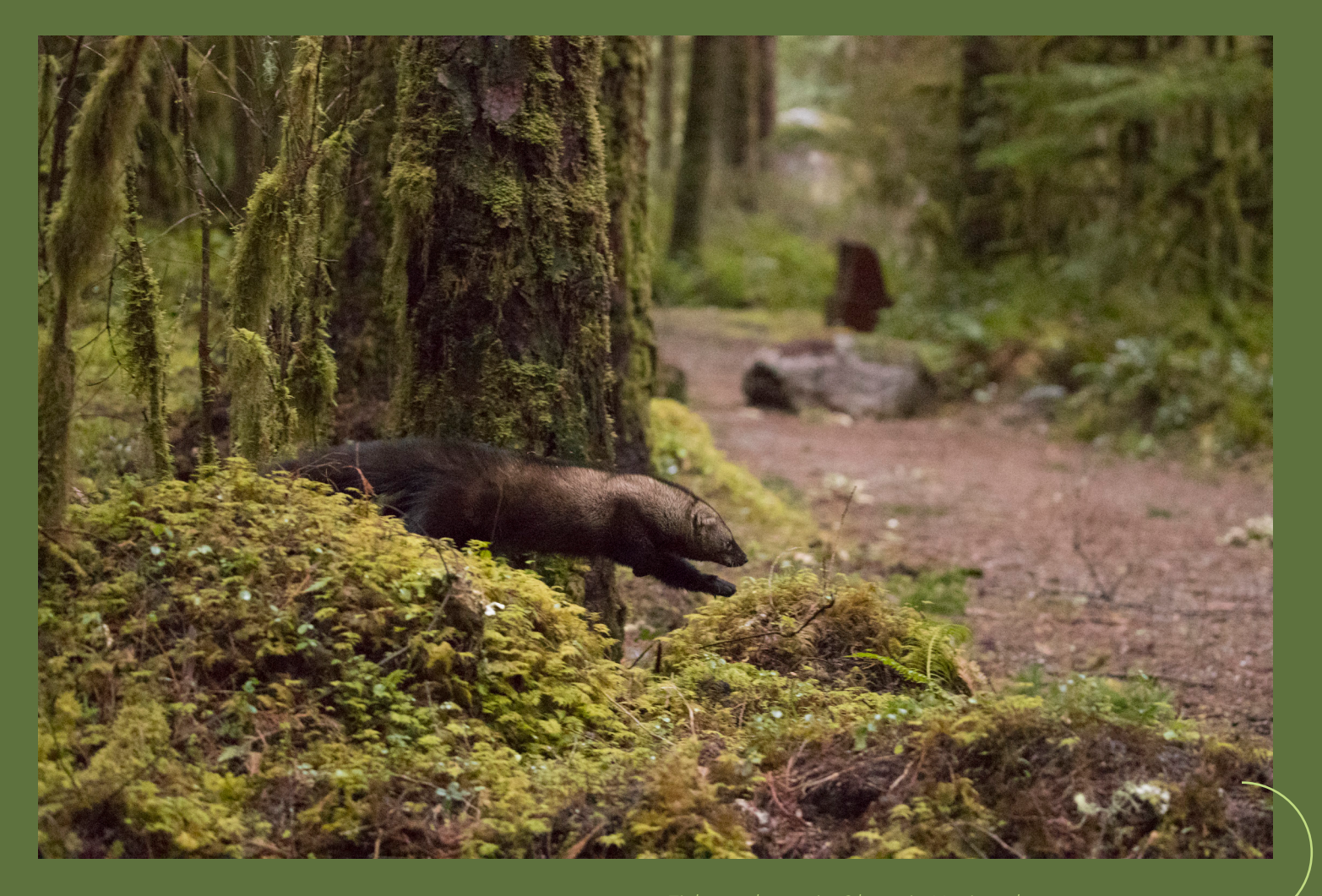
Fisher release in Olympic National Park, 2019. Photo by Paul Bannick. @