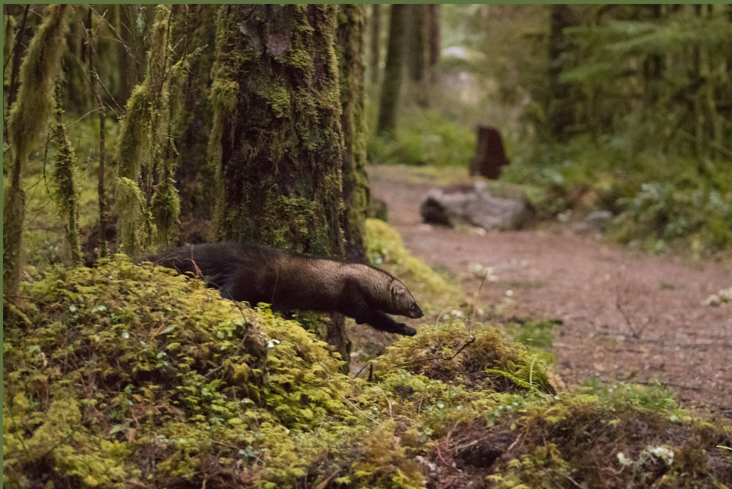
Fisher release in Olympic National Park, 2019.

WHAT YOU CAN DO to keep the Northwest wild