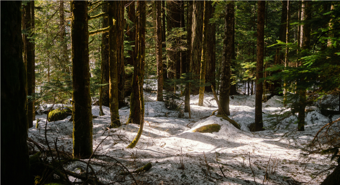
One of our many community wildlife monitoring program sites along Snoqualmie Pass.

For 20 years, Conservation Northwest's annual Hope for a Wild Future Auction & Dinner has been one of Seattle's premier fundraising events. We bring together 300 of our region's top conservationists, philanthropists, and local business and community leaders each year. Your sponsorship would be an influential part of an evening of exciting live paddle raises, a multi-week online silent auction, and presentations from the Northwest's top conservationist leaders. This event brings in more than $400,000 to support innovative conservation programs throughout Washington and lower British Columbia.