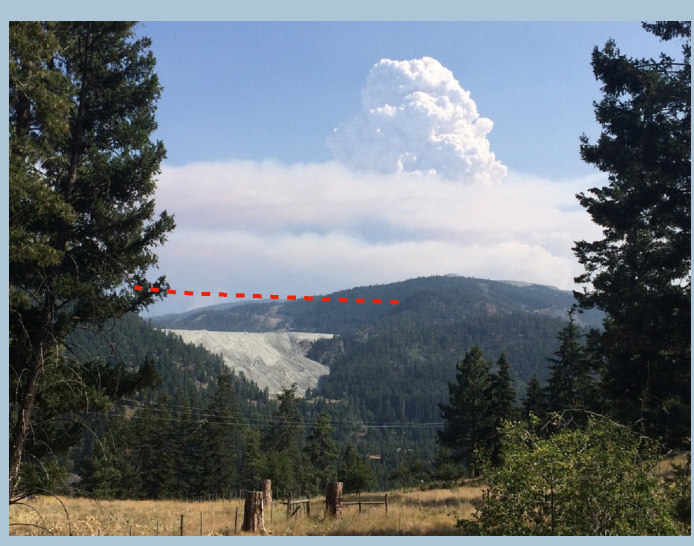
If the tailings dam is raised to a height of 853 ft, it will be taller than the Seattle Space Needle, which is 605 ft.

To make matters worse, the owners of Copper Mountain are moving to expand the operations, increasing production by 70 percent and raising the current tailings management facility by a staggering 360 feet, a 73 percent increase over the current height. Moreover, the mine operator has posted a paltry bond of $7,040,000 which is far less than what is needed to cover the true costs of long-term monitoring, reclamation, recovery, and restoration of the environment following closure of the mine.